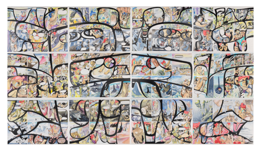
Michael Nicoll Yahgulanaas, RED (detail), 2008. Watercolour, ink on paper.