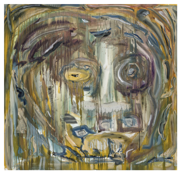
Manuel Mathieu, Rivière froide 3 , 2017. Acrylic, tape, charcoal, chalk, oil sticks on canvas. Courtesy: Sheldon Inwentash and Lynn Factor, Toronto. Photo: Guy L'Heureux.