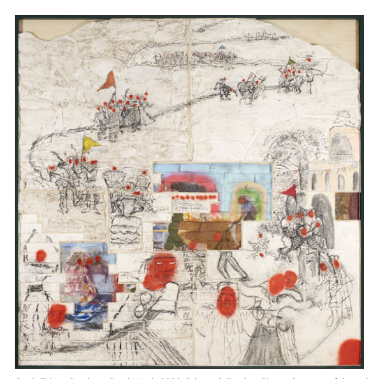
Curtis Talwst Santiago, Road March, 2020. Private Collection.