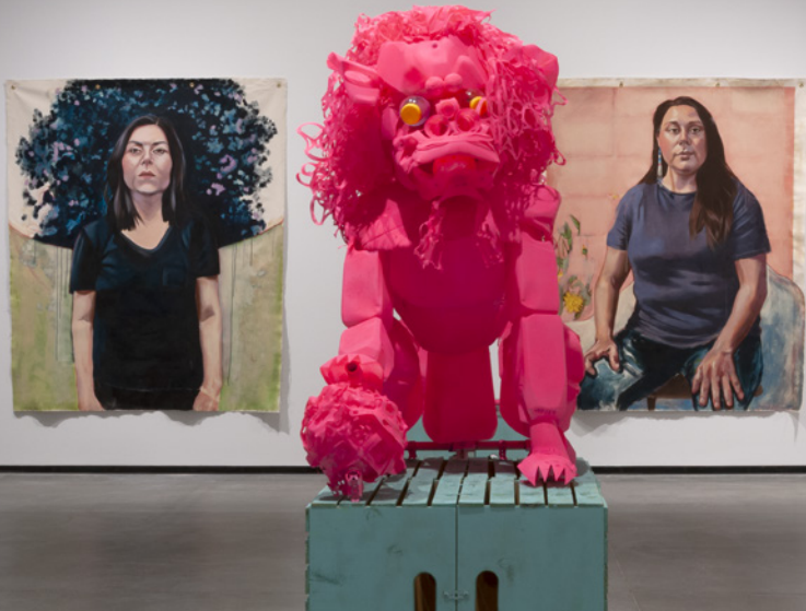
Left to right: Lauren Crazybull, Coty , 2020, acrylic on canvas; Yong Fei Guan, 塑胶狮 Sujiao Shi , 2018, household plastic waste, pvc pipe, screws, nails and wood; Lauren Crazybull, Kristen , 2020, acrylic on canvas. Installation view of The Scene , Art Gallery of Alberta, Edmonton, 2021.