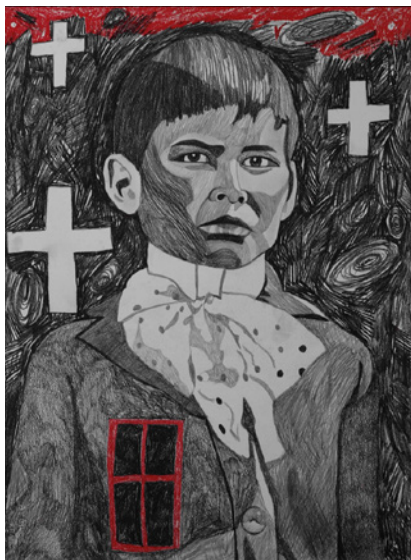
George Littlechild, Photo: Unidentified Child From The Ermineskin Indian Residential School #3, 2019 . Mixed Media on Paper, 30”h x 22”w. This work was supported by the British Columbia Arts Council.