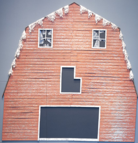
Jude Griebel, Barn Skull , 2019, 200”h x 192”x 6”, wood, acrylic paint, synthetic hair. Courtesy of the Artist. Photo: Art Gallery of Alberta.