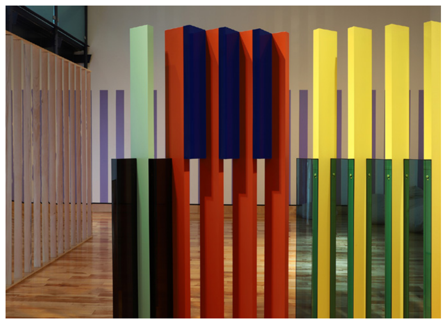
First We Take the Museum (installation view), 2019. The Rooms, St. Johns, NL.