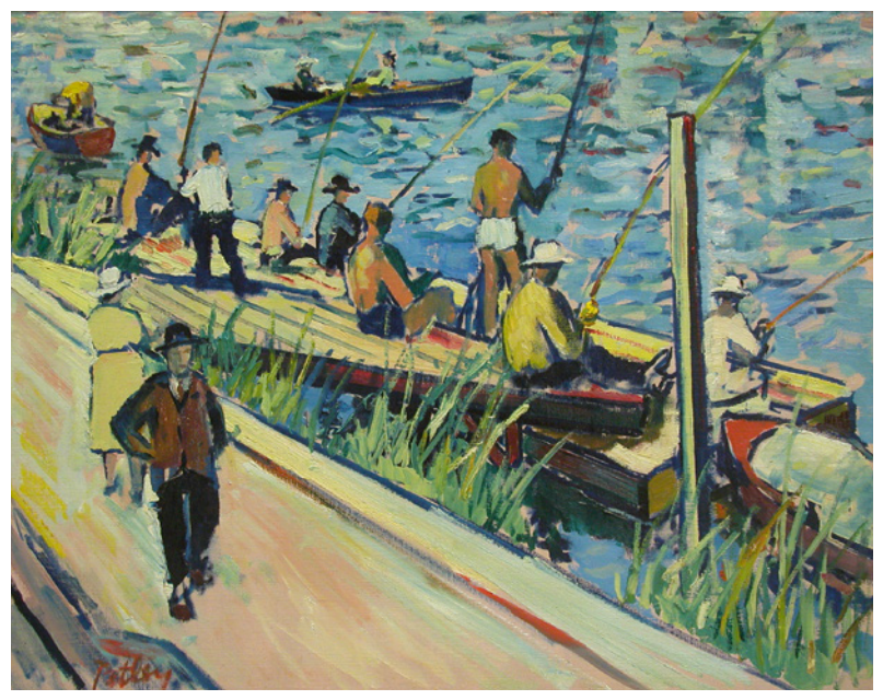
Llewellyn Petley-Jones, The Anglers , c. 1948. Oil on linen. Collection of the Art Gallery of Alberta, purchased 1950.