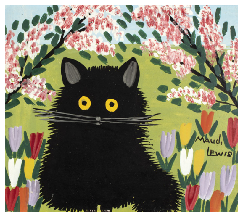
Maud Lewis, Untitled (Black Cat with Tulips and Apple Blossoms) (detail), c. 1962. Oil on board.