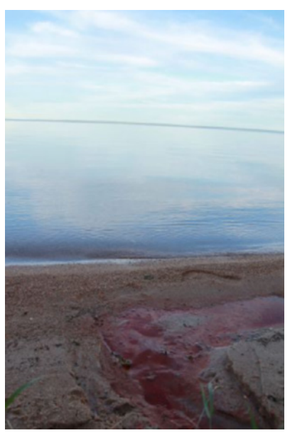
Tanya Harnett, Cold Lake First nation: Damaged Spring at Blueberry Point, 2011. Art Gallery of Alberta Collection, purchased with funds from the Canada Council for the Arts New Chapter Grant Program.