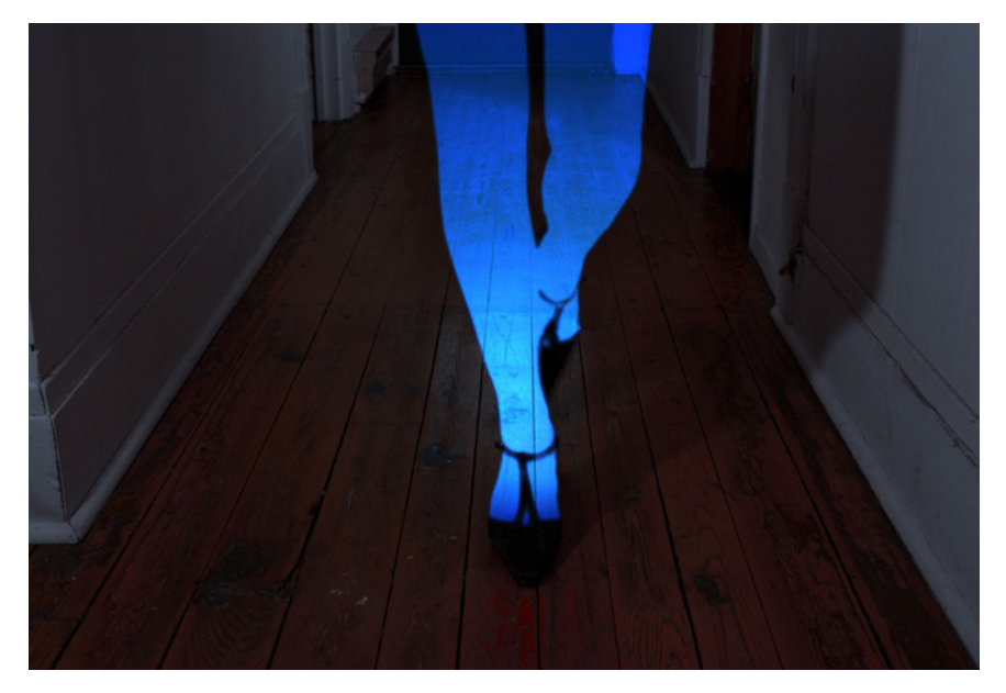
Anna Hawkins, Blue Light Blue (still), 2020. Courtesy the Artist.