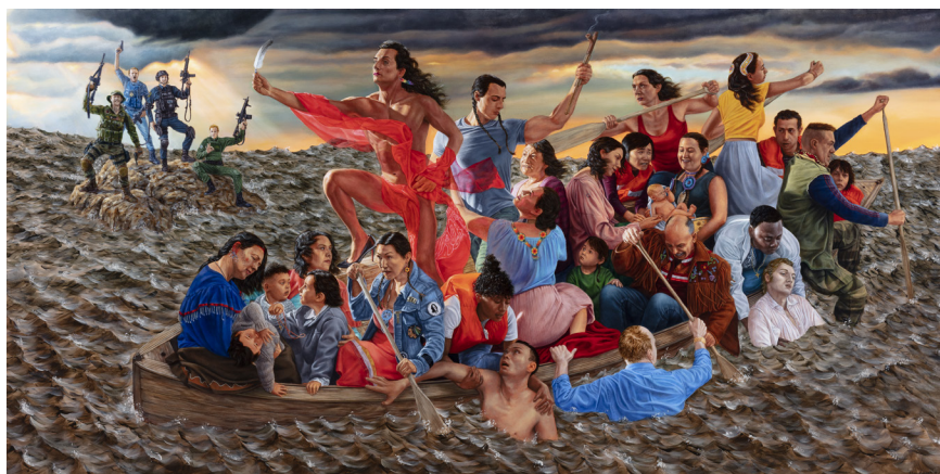
Kent Monkman, Study for "mistikôsiwak (Wooden Boat People): Resurgence of the People," (Final Variation) , 2019. Acrylic on canvas. Collection of the Sobeys Art Foundation