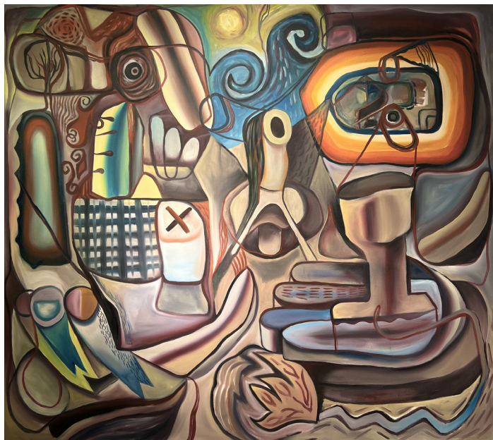
Hanny Al Khoury, Revenge , 2022. Oil on canvas.