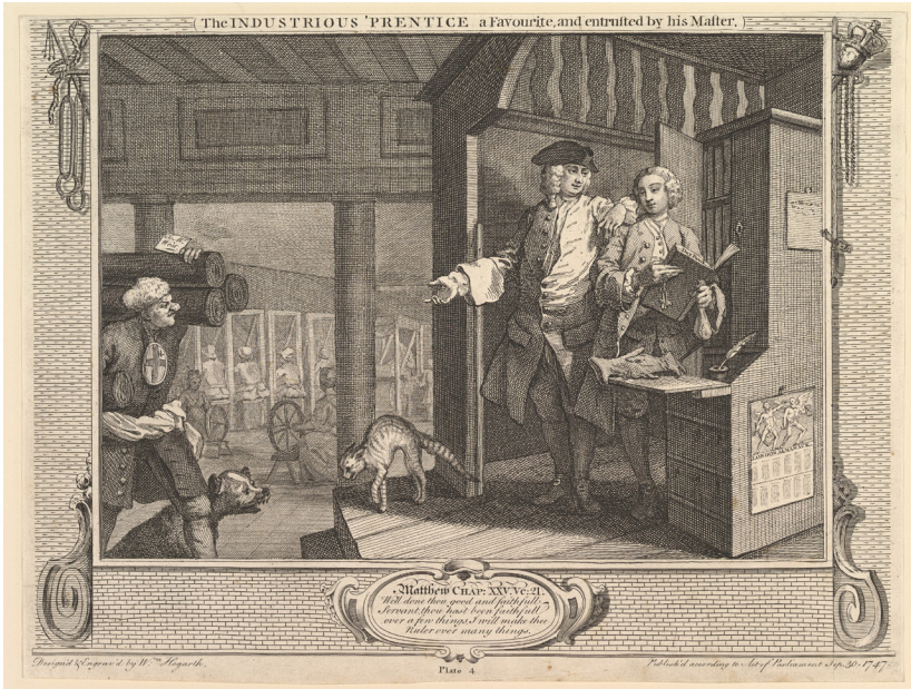
William Hogarth, Industry and Idleness , plate 4, 1747. Etching and engraving.