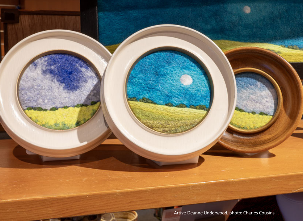
Artist: Deanne Underwood