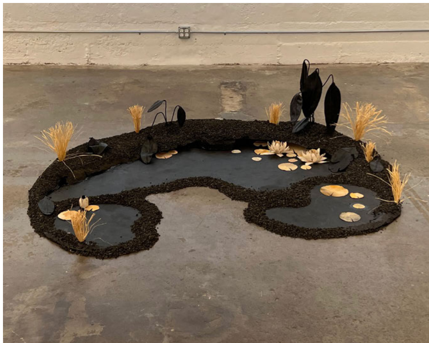
Braxton Garneau, Pond , 2023. Mixed media installation.