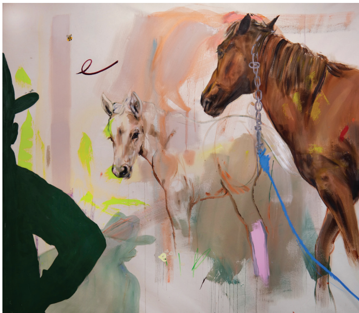
Ally McIntyre, Wobbly Knees , 2023. Acrylic paint on canvas. Courtesy of the Artist.