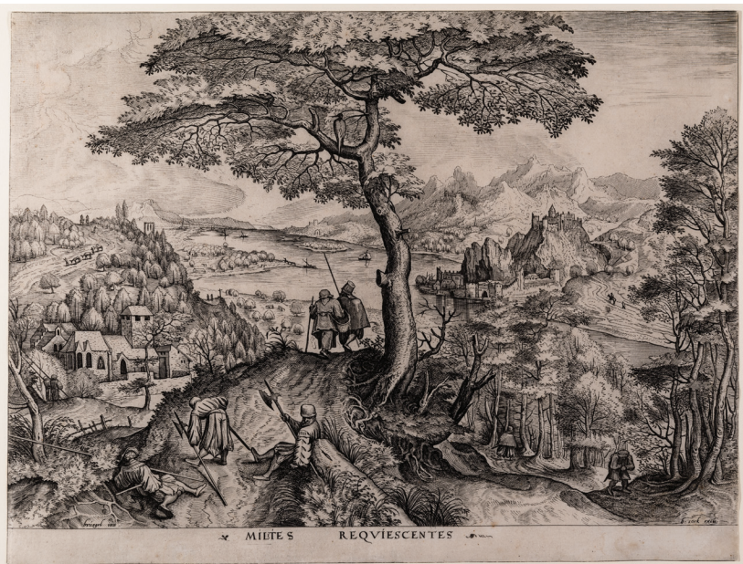
Lucas van; Doetechum Doetechum, Soldiers at Rest (Milites Requiescentes), c. 1555-1557. Etching and engraving on laid paper, 32 x 42.5 cm, trimmed. Gift of the Meakins-McClaran Collection, Montreal, 2022.