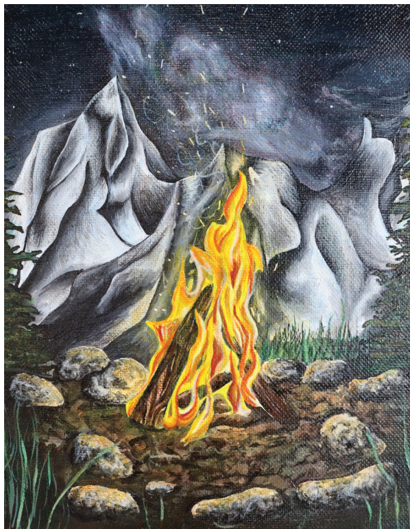
Miya Lamoureux, Campfire on the Mountaintops , n.d. Acrylic on canvas.